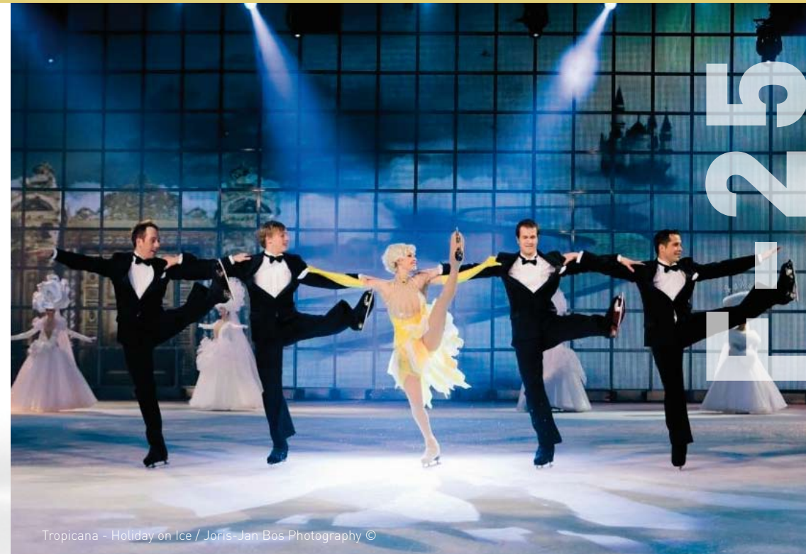
Tropicana - Holiday on Ice

The F-25 is a lightweight, highly transparent LED video display with a rugged IP65 rating suitable for both indoor and outdoor applications. With its 25mm pixel pitch, 4,000 NIT light output and rugged IP65 rating, the F-25 is an ideal solution for applications with long viewing distances. The F-25 is ideal for applications with long viewing distances and wide viewing angles. The F-25 features 4.4 trillion color processing and the Radiant color calibration system which operate simultaneously to deliver rich, vibrant video images with superb color depth and uniformity across the entire display surface. With a transparency factor of 55%, the F-25 opens up a wide range of creative design possibilities without compromising on image quality.